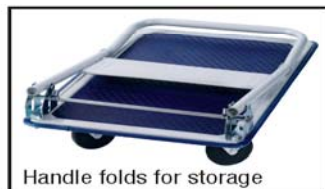
Handle folds for storage