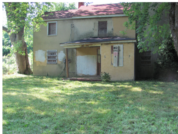
Goshen Farm House, built in the late 1780's. One of two original farms that owned the land now known as Cape St. Claire.