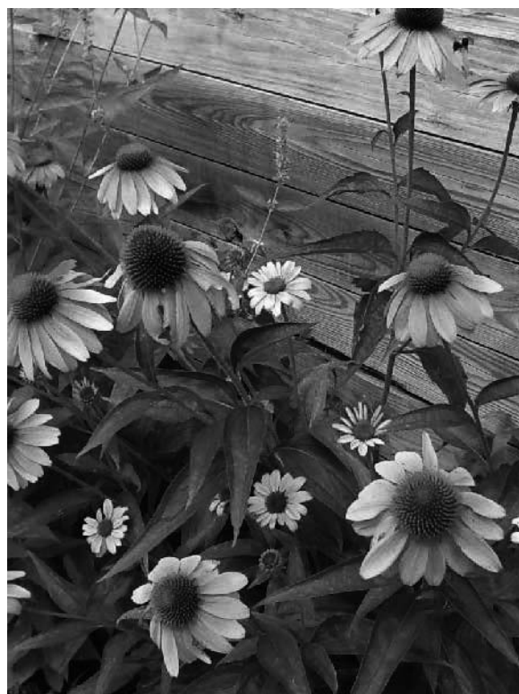
Echinacea purpurea

By using natives in our gardens we use less water and less energy to maintain their beauty. We can also eliminate the use of pesticides because natives will attract native beneficial