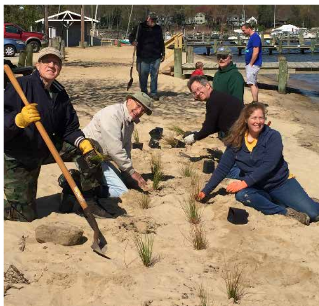
Volunteers plant Juncus effuses - smooth rush along the new sand dune at Lake Claire

Thank you to the CSC Garden Club for their generous donation of $339.00! They raised this money through their plant auction, as well as the donations collected at their annual plant sale. We are so grateful for the support of the Garden Club's and for the support of all the generous individuals who made donations in exchange for compost and mosquito dunks!