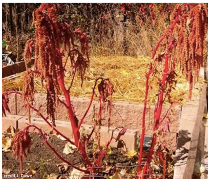
Healthy standing perennials provide habitat for beneficial insects.