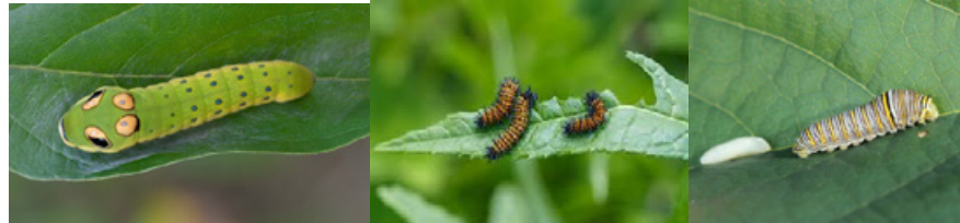
Spicebush Caterpillar on Spice bush