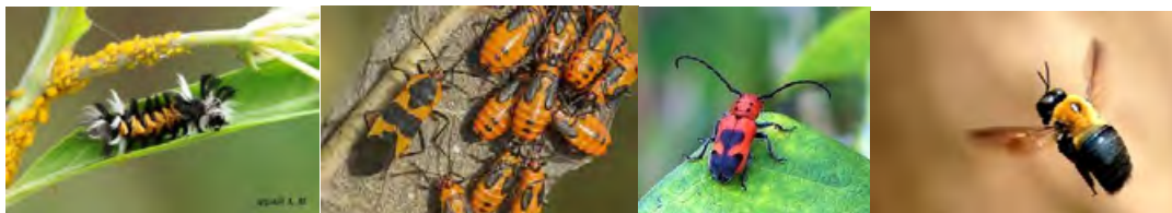
Milkweed Tussock Red milkweed bugs milkweed beetles carpenter bees

Please find ways to co-exist with these gentle giants. The males CANNOT sting but they are typically the ones with an aggressive behavior, keeping potential enemies away; and the females RARELY sting, only if directly provoked by catching them. The benefits they provide to our ecosystem are far greater than any perceived threat, danger or damage they cause. One of my favorite things to do on a spring or summer evening is observe their little bare bottoms sticking out of my native plants as they do the hard work of pollinating my garden. Be gentle, educate yourself before poisoning these incredibly useful bees!