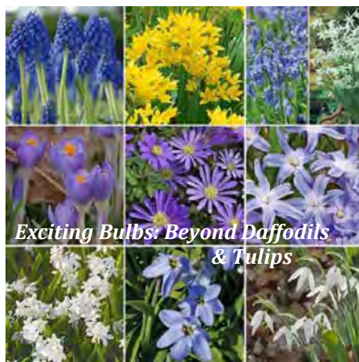
Exciting Bulbs: Beyond Daffodils & Tulips

Tues Oct 3, 7pm: Exciting Bulbs Beyond Tulips & Daffodils , by Charles O Cresson of Hedgeleigh Gardens Sunday Oct 15, 6pm: Harvest Dinner celebrating another bountiful growing season Tues Nov 7, 7pm: Terrarium Workshop: Create a terrarium to enjoy indoors, all winter long Tues Nov 29, 7pm: Evergreen Wreath Workshop: Help create wreaths for Cape Clubhouse & State Circle