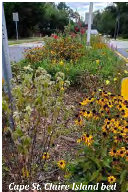
Cape St. Claire Island bed

Well, September, that was quite a heat wave you sent us! We hope our Cape neighbors stayed cool while harvesting bountiful tomatoes, zucchini, cukes, & herbs in the heat, and that October brings us some cooler temperatures at long last. Chrysanthemums and asters will bring us one last burst of color in the garden – stop by the Clubhouse for a brilliant display, on your way to all the wonderful Cape Halloween festivities!