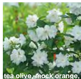
tea olive, mock orange,