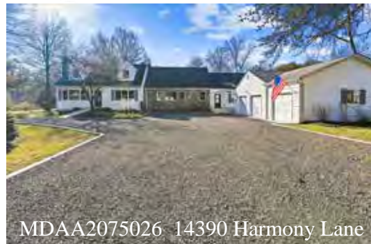
MDAA2075026 14390 Harmony Lane

4-5 Bedrooms 3 Full Baths Basement rough in Washer/ Dryer Circular Driveway Prof Landscaping Screened Porch 3 LP fireplaces Dramatic Kitchen