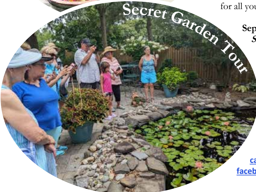
Secret Garden Tour