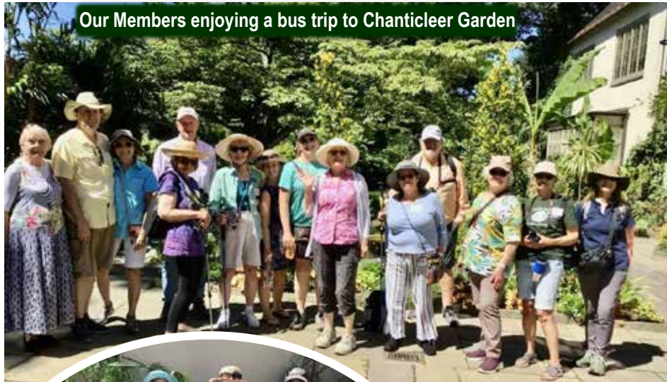
Our Members enjoying a bus trip to Chanticleer Garden

Our Members are usually pretty pooped after our annual Plant Sale in May, but this year we celebrated twice in June, first with an ice cream social and yet another plant raffle (of course!) at our June meeting. Then a