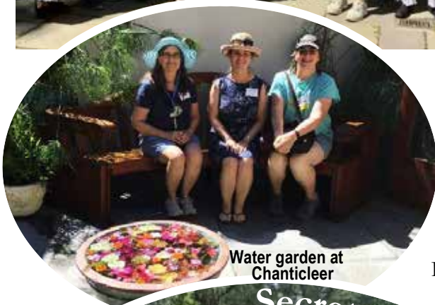
Water garden at Chanticleer