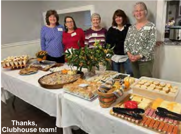
Thanks, Clubhouse team!

As you rake leaves this year, consider using your fallen leaves as mulch, even just in the backs of your gardens where tidiness is less important. Over the wet winter, leaves break down beautifully into compost that feeds your soil and soil microbes, leading to healthier plants. If you'd like to speed up the composting process even more, chip the leaves up into smaller pieces using your mower or dedicated chipper – your plants will thank you!