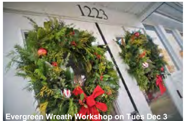
Evergreen Wreath Workshop on Tues Dec 3