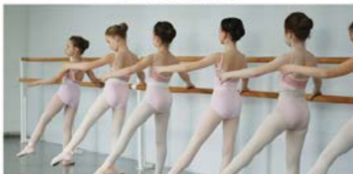
BALLET INT OPEN AGES 10+ W/BALLET EXP