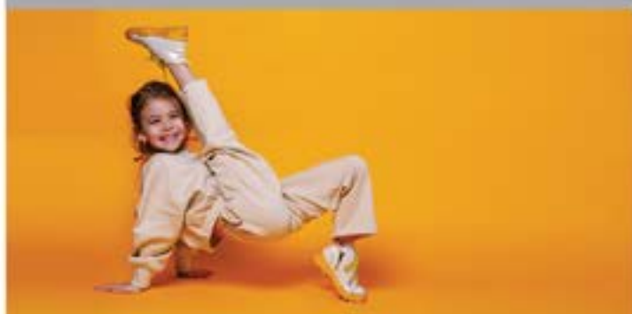
HIP HOP BEG AGES 6-10