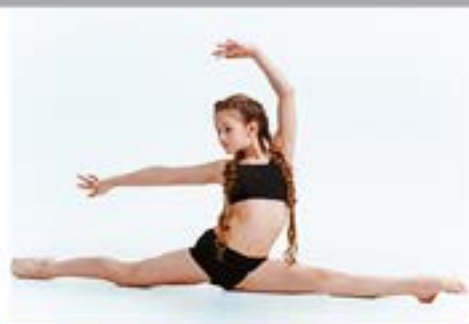
ACRO INT/ADV AGES 9-16