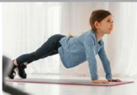
ACRO BEG/INT AGES 6-9