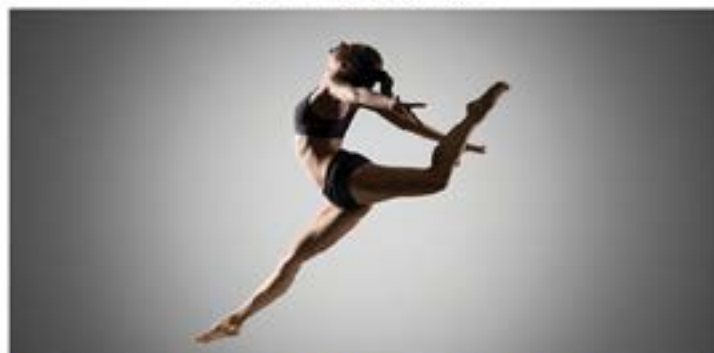
LEAPS AND TURNS AGES 10+