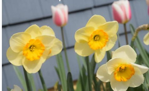
Daffodils & Tulips at our Clubhouse

In March, we'll celebrate the 50 th anniversary of our Club's founding, and 50 years of service to our beloved Cape community. Together, Members will savor a catered dinner, 2 new Club t-shirts drawn by 2 local artists, and lots of flowers, of course! We'll share very old photos of our founding Members and invite them to join us for our big celebration. Then our April 1 st meeting will start early at 6pm so we can work outside, and will feature a hands-on Dividing Perennials Workshop . If you've always wondered how to divide your massive clumps of hosta, iris, fountain grass, or phlox into new plants to spread around your garden, this workshop is a good one for you! We'll provide cutting tools and work together to divide, then re-pot, several types of perennials so that all will leave the workshop with more knowledge and experience they can apply in their own gardens – you're invited to join us! And if you'd like to donate plants for dividing, please email us beforehand at capegardenclub@gmail.com and let us know what you're bringing – thank you!