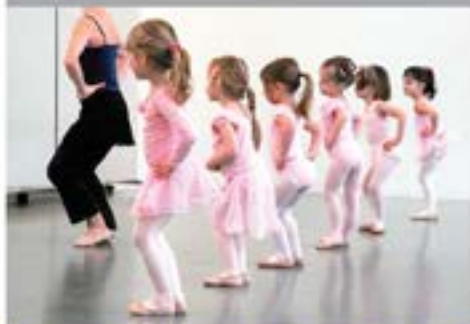
PRE-BALLET/TAP AGES 3-4