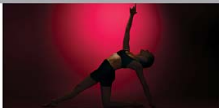
MUSICAL THEATRE JAZZ INT 10+